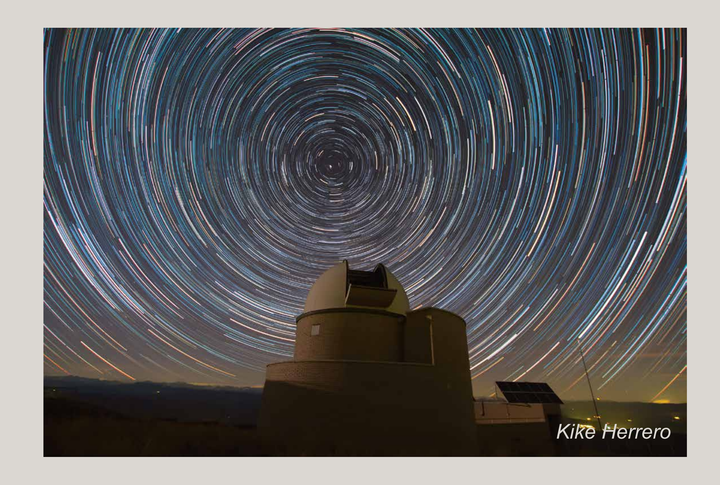
The Montsec Observatory (Sant Esteve de la Sarga, Lleida) contributes to the observations of Gaia scientific alerts.